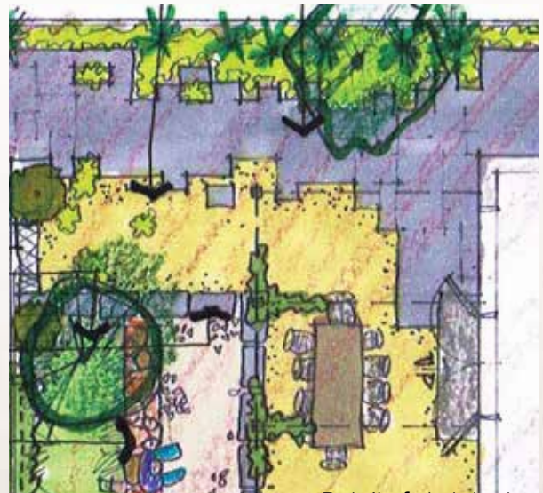
Detail of sketch plan

photos, we inspired the client to actively participate in the design process, by cut-and-pasting their own combination of the range of offered solutions.