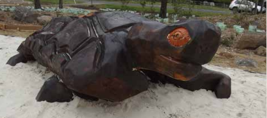
Turtle Play sculpture by Victor