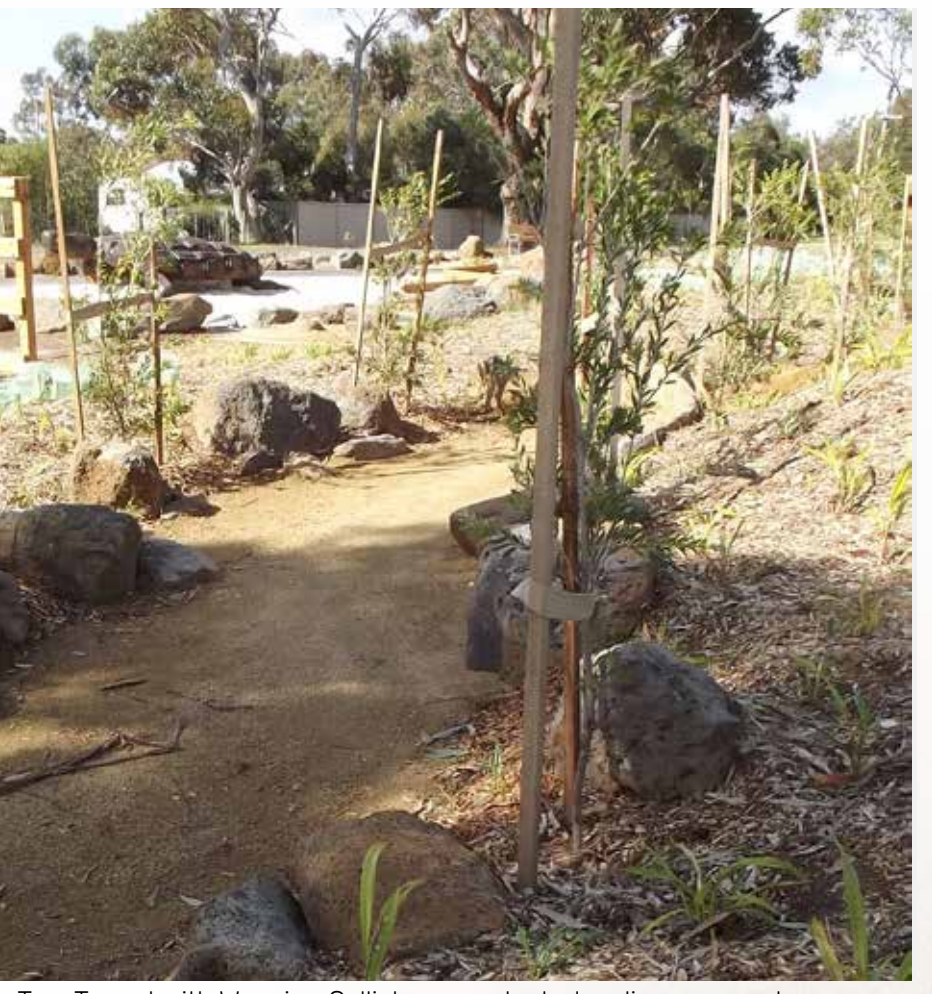
Tree Tunnel with Weeping Callistemons planted on linear mounds.