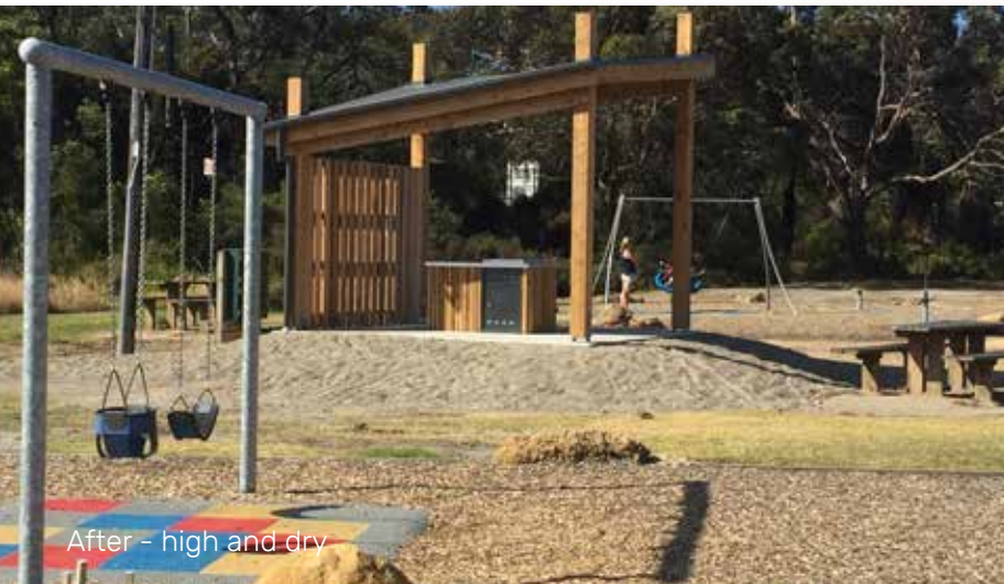
After - high and dry