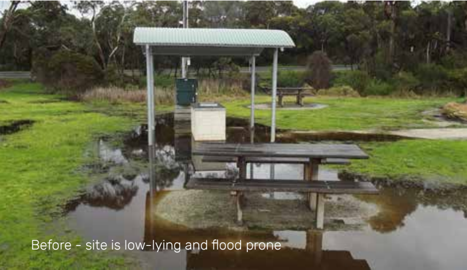
Before - site is low-lying and flood prone