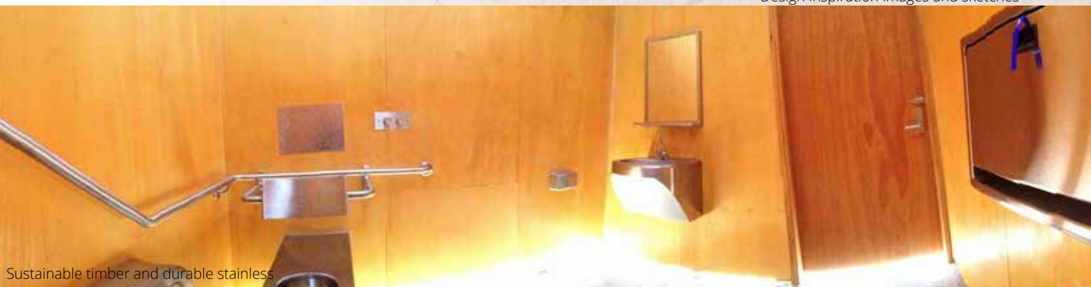
Sustainable timber and durable stainless