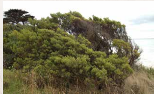
Design inspiration images and sketches